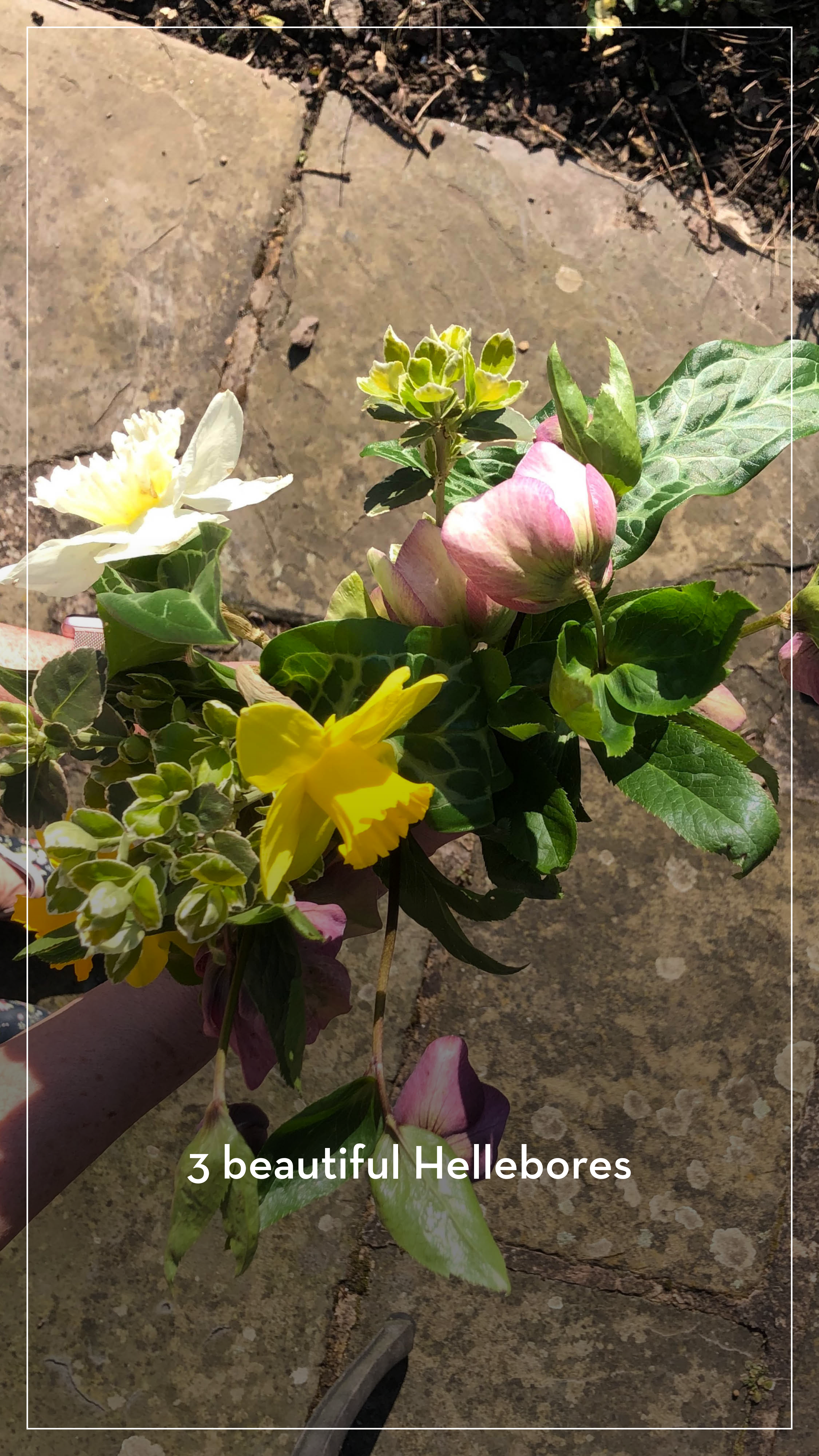
3 beautiful Hellebores